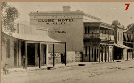
Globe/Kingsford Hotel (1851-); c.1897