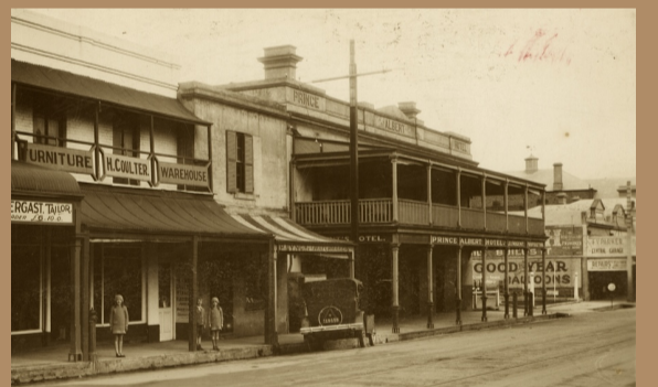
Prince Albert Hotel, c.1932