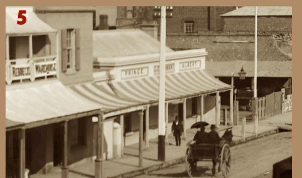
New Bushmans'/Prince Albert (1859-), c.1901