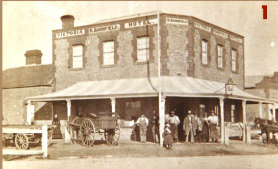
Victoria/Willaston Hotel (1866-); c.1882

Downloadable freely for non-commercial purposes from www.liquidhistory.au