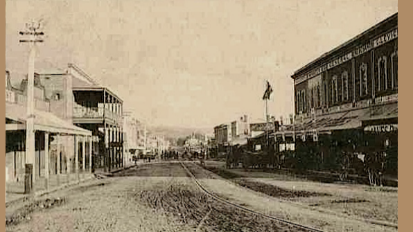
Exchange Hotel on Murray Street North, c.1900