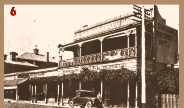
Golden Fleece/The Old Spot (1839-); c.1926