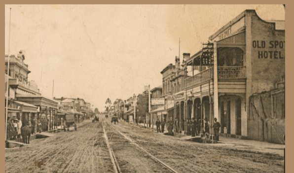
The Old Spot; c.1897