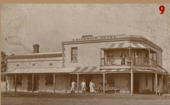
Engine & Driver/Criterion (1864-); c.1890