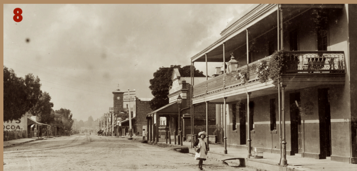
Grapes/Commercial Hotel (1855-) on Murray Street South; c.1910