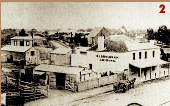
Old Bushman (1840-); c.1874