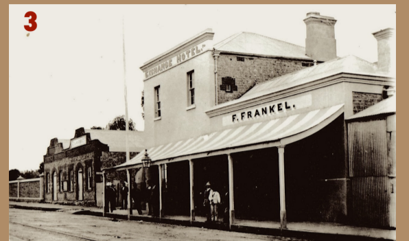
Exchange Hotel (1868-), c.1880